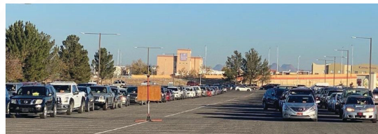
Pictured here: The line for turkey basket pick-up at the Pan Am Center, 7:00 AM, November 21, 2022

Despite the scarcity and expense of turkeys, CdP was determined to make Thanksgiving joyful for our clients.