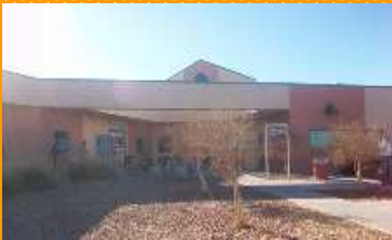
Casa de Peregrinos Building

Casa de Peregrinos (House of Pilgrims) is a non-profit (501(c)(3) tax exempt #85-0312057) emergency food program designed to provide basic, nutritional food boxes and a supportive atmosphere to individuals and families in the Dona Ana County who are unable to purchase nutritional groceries due to an emergency or unforeseen crisis. Our program is designed to meet these needs but we do not have enough funding to be an indefinite source of relief.