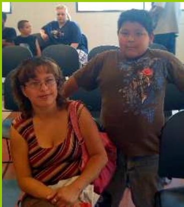
Cdp Client and her child