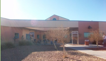
Casa de Peregrinos Building

Casa de Peregrinos (House of Pilgrims) is a non-profit emergency food program designed to provide basic, nutritional food boxes and a supportive atmosphere to individuals and families in the Dona Ana County who are unable to purchase nutritional groceries due to an emergency or unforeseen crisis. Our program is designed to meet these needs but we do not have enough funding and we cannot be an indefinite source of relief.